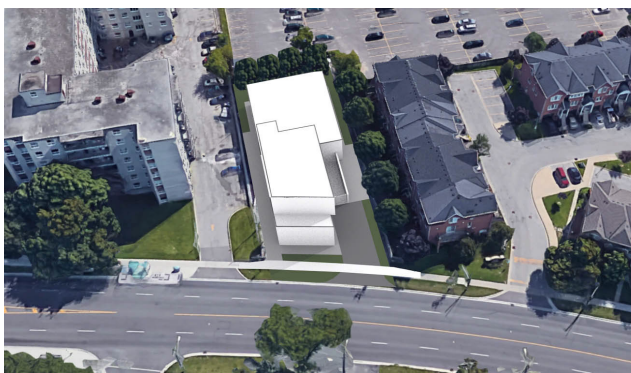
Aerial of substation site at 1269 Danforth Road