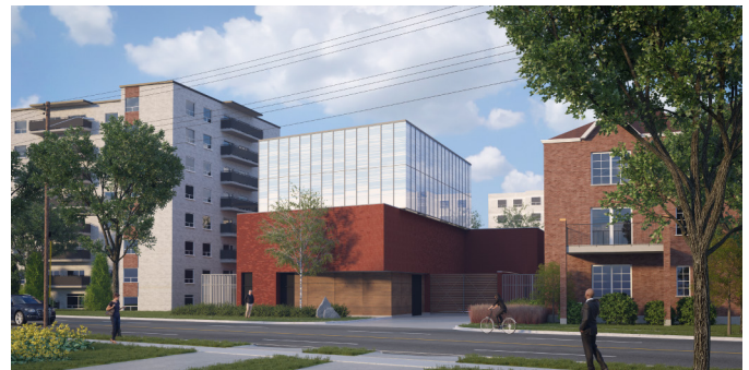
Preliminary Design Concept for Substation at 1269 Danforth Road