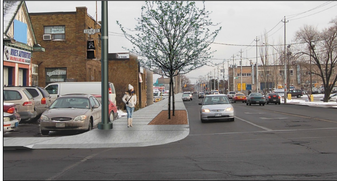
Eastern & Leslie After Improvements

Leslie Streetscape Improvement Plan: Leslie Street at Eastern Avenue